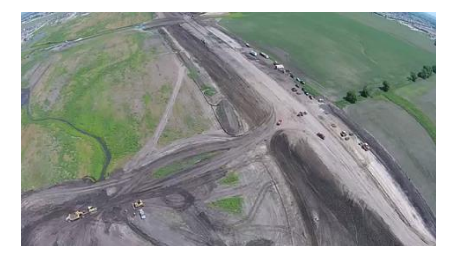
Take flight in this video from the developers behind the Kettlestone project.